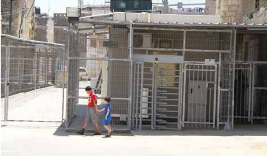
The restrictions do not only affect Palestinians' freedom of movement and their access to education, but they have also resulted in the abandonment of streets and areas of the Old City, leaving them derelict. The photograph shows two Palestinian children crossing an Israeli checkpoint, near ash-Shuhada Street. (5 August 2016, BADIL)