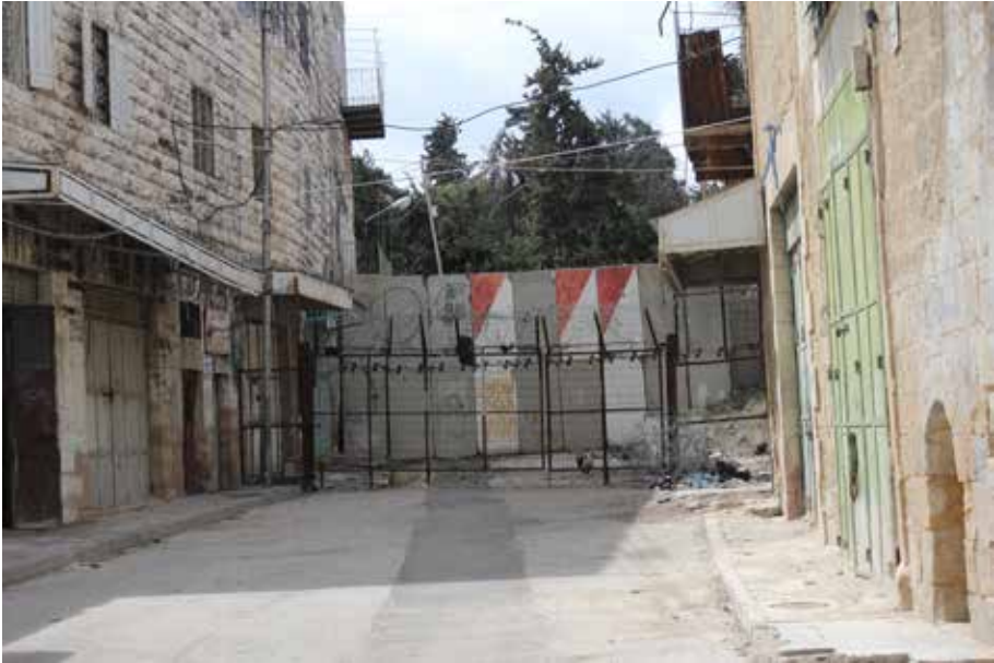
Blocked access to ash-Shuhada Street from the Old City: the blockades prevent many goods and supplies from reaching the Old City markets. (27 March 2015)