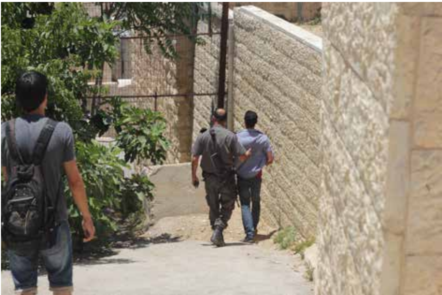
It is quite common for Palestinian residents of the Old City to get arrested by the Israeli forces from their homes, or sometimes from the street directly, as seen in the photograph. Israeli soldiers arrest a tour guide near the Ibrahimi Mosque, as he was showing a group around the Old City (22 June 2013)