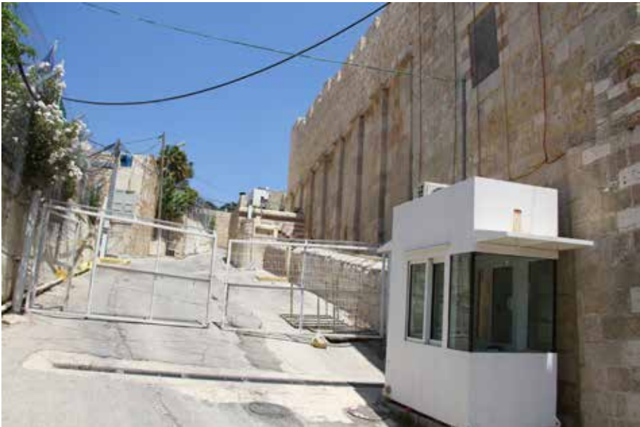
Checkpoint at the entrance to the Ibrahim Mosque. (5 August 2016, BADIL)