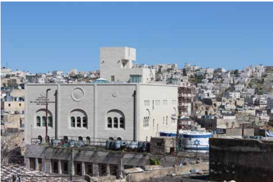
Bet Romano colony with the Old City in the background. The colonizers established this colony by occupying an old school. (5 April 2015, BADIL)