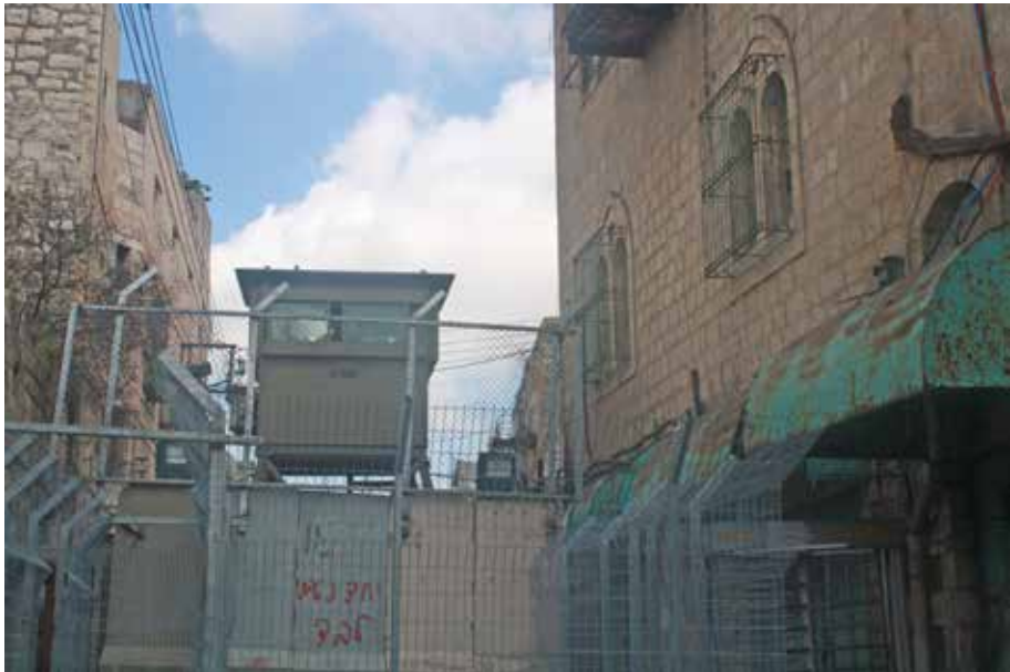
The Bab az-Zawiya checkpoint marks the border between H1 and H2 and completely blocks the street. Most Palestinian residents of ash-Shuhada Street or Tel Rumeida need to cross it daily. (19 March 2015, BADIL)