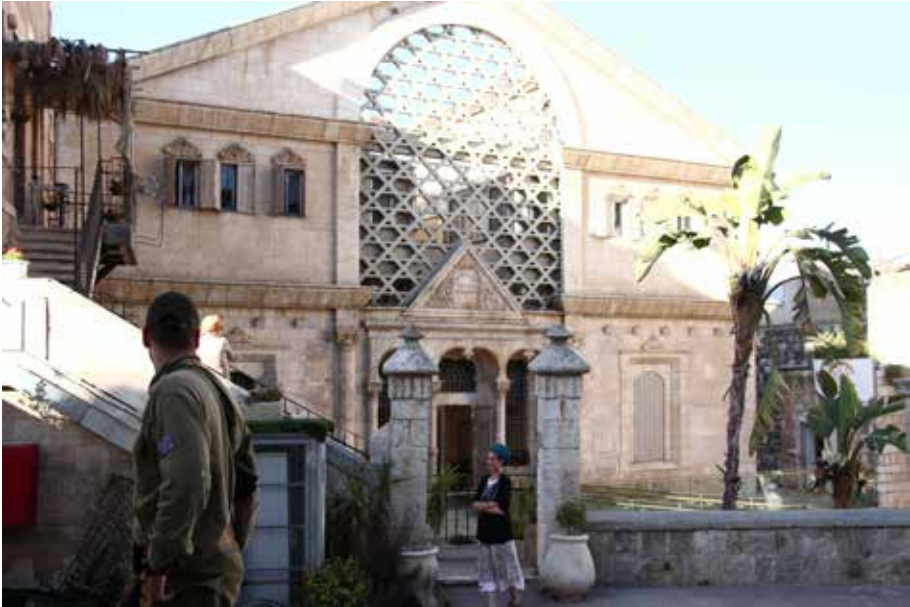
Beit Hadassah colony, located in ash-Shuhada Street. Some colonizers and a soldier can be seen at the entrance to the colony. Palestinians are not allowed through ash-Shuhada Street, and are given access to only a few meters of it. Beit Hadassah is forbidden to all Palestinians. (4 June 2015, BADIL)