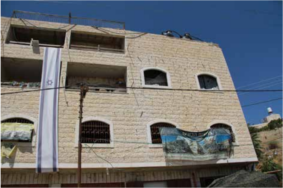
Al-Rajabi house, owned by the al-Rajabi family and occupied by Israeli colonizers and the Israeli forces in April 2014.