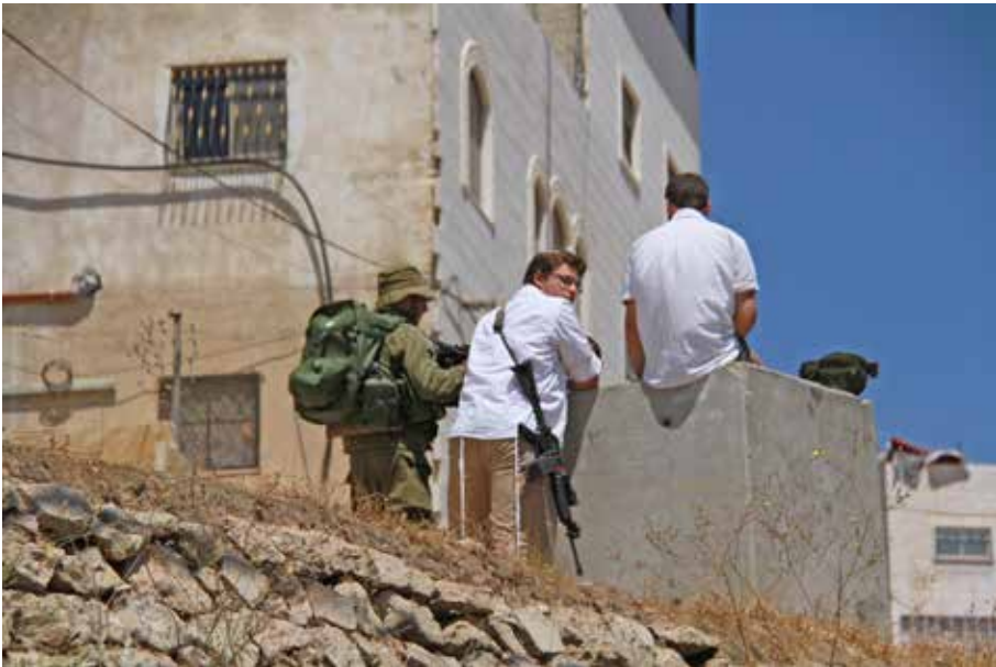
The majority of Israeli colonizers in and around the Old City of Hebron are armed. The photo shows two colonizers, one of them holding a machine gun, chatting with an Israeli soldier outside Hebron’s Old City. (5 August 2016)