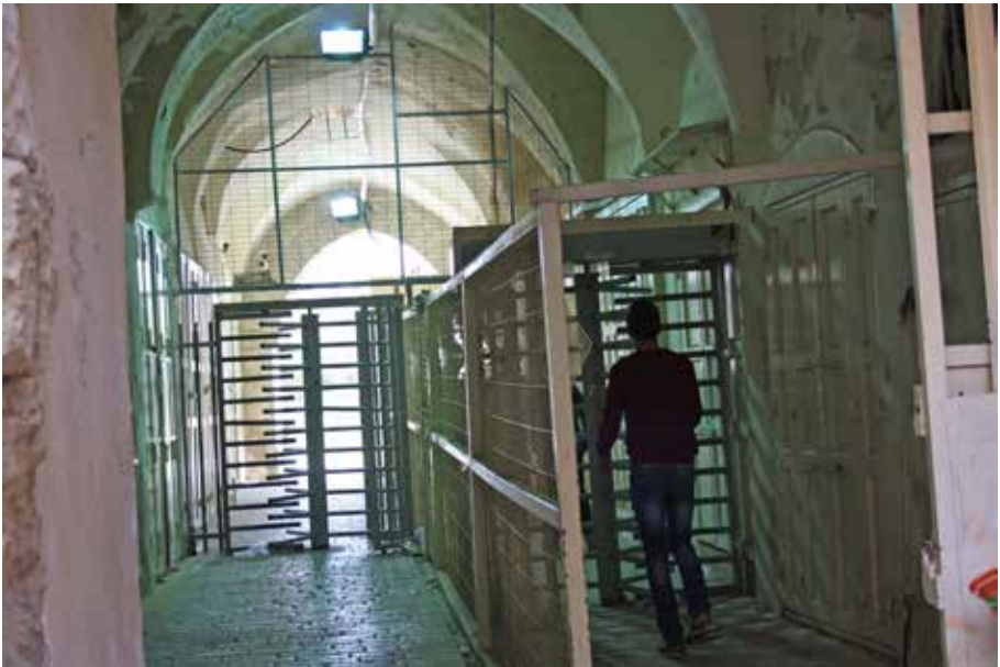
Checkpoint between the Old City center and the Ibrahimi Mosque. During Jewish holidays this checkpoint is closed, and Palestinians are not allowed to access the Ibrahimi Mosque or its surroundings. (27 March 2015, BADIL)