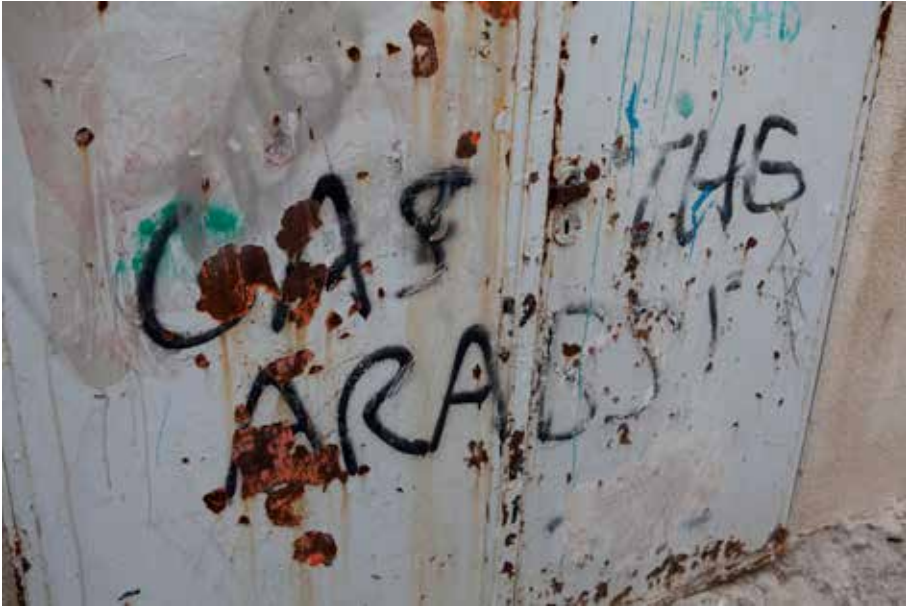
Graffiti written on a wall in the Old City that reads “Gas the Arabs” and signed “JDL,” which stands for ‘Jewish Defense League,’ a right-wing political movement. This kind of graffiti is common in the Old City. (June 2015, BADIL)